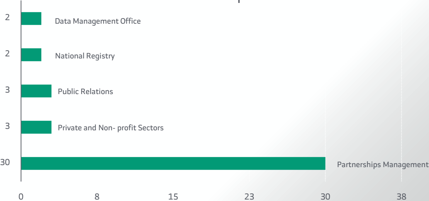
Total Number of Departments