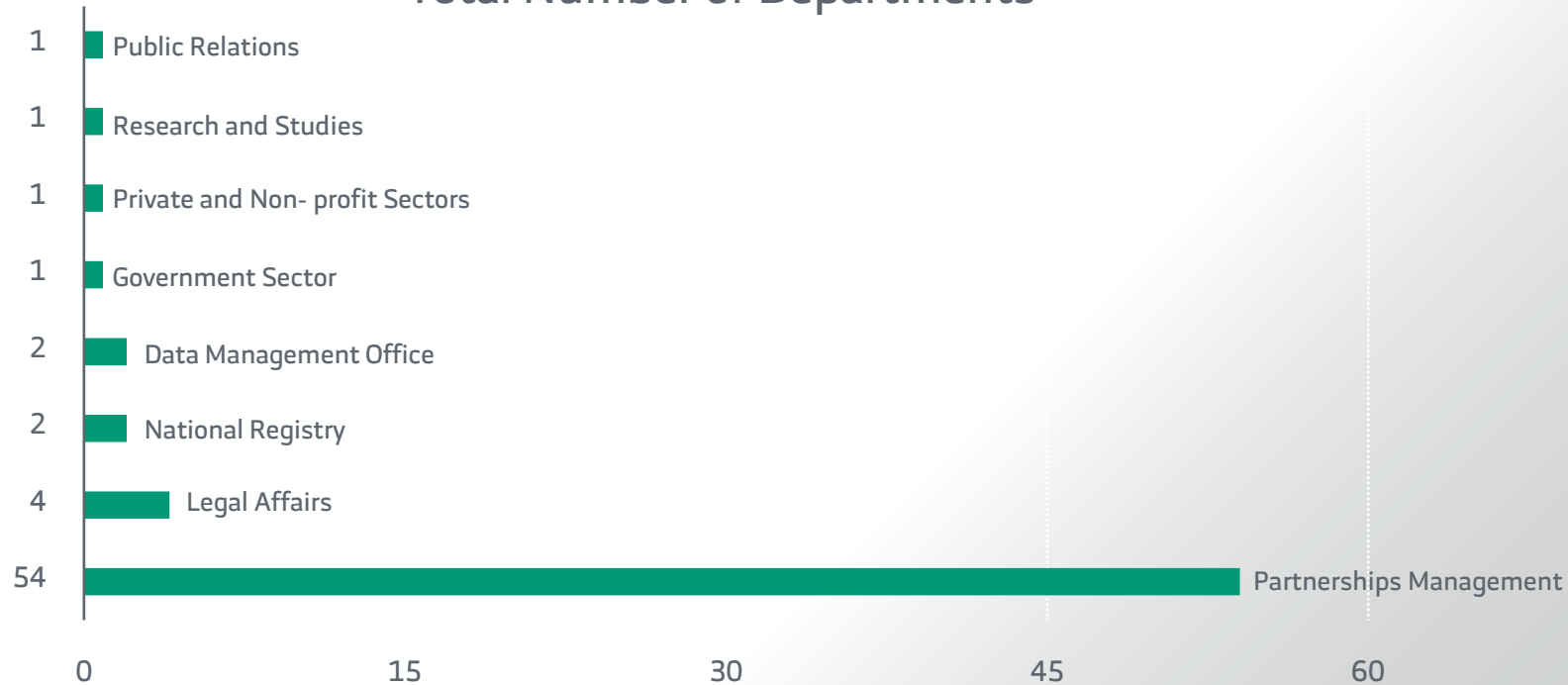
Total Number of Departments